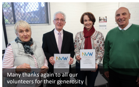
Many thanks again to all our volunteers for their generosity