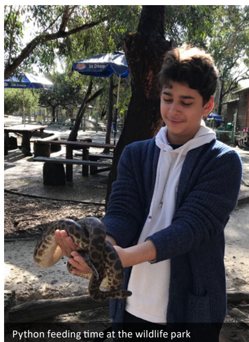
Python feeding time at the wildlife park

During the recent activities week students and staff from Years 9 and 10 visited the Australia Walkabout Wildlife Park at Calga.