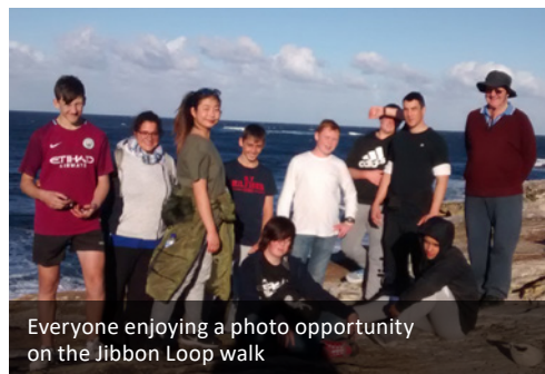
Everyone enjoying a photo opportunity on the Jibbon Loop walk

Year 7 & 8 students participated in a school camp earlier this term that took place in the Royal National Park at Bundeena.