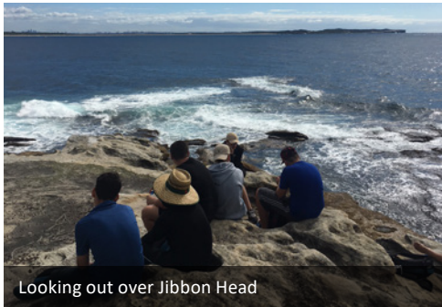
Looking out over Jibbon Head

As part of the Outdoor Education Program here at Berne Year 9 students and staff had the opportunity to spend three days camping at the beautiful Bonnie Vale campsite in the Royal National Park, Bundeena.