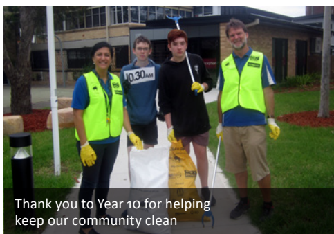
Thank you to Year 10 for helping keep our community clean

On Friday 3rd March, Year 10 students engaged in cleaning up the school grounds in support of the National Clean Up Australia campaign which was held on Sunday 5th March.