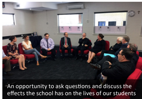
An opportunity to ask questions and discuss the effects the school has on the lives of our students