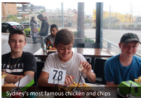
Sydney's most famous chicken and chips