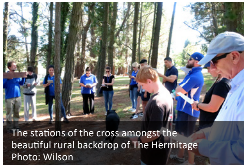
The stations of the cross amongst the beautiful rural backdrop of The Hermitage

Every year on Holy Thursday The John Berne School staff and students return to the Marist Brothers' property, The Hermitage, in Mittagong to spend time together and learn about Jesus's journey through the stations of the cross.