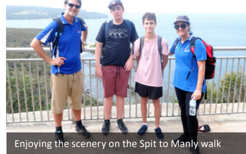
Enjoying the scenery on the Spit to Manly walk

On day three we cancelled our canoeing trip on the Lane Cove River due to poor weather but we enjoyed watching Black Panther at Broadway cinemas and returned to school to enjoy a big barbeque lunch.