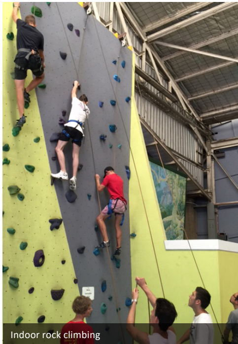
Indoor rock climbing

The Annual Berne Luncheon 2017 will be held on Friday 5th May from 12 noon to 3.30pm at Doltone House Hyde Park. Invitations will be sent out soon.