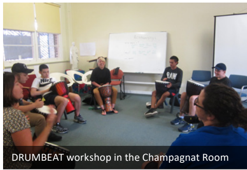
DRUMBEAT workshop in the Champagnat Room

The DRUMBEAT program is the world's first structured learning program using music (drums), psychology and neurobiology to reconnect with ourselves and others. The brand name DRUMBEAT is an acronym for Discovering Relationships Using Music, Beliefs, Emotions, Attitudes, and Thoughts.