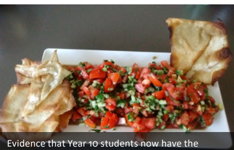
culinary skills to cook for their families

So far we have created numerous pasta meals and salads. The students proved that they are willing to try different cuisines and as a result we have enjoyed a variety of meals from around the world.